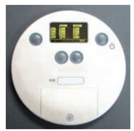
Example of a radiometer that displays irradiance and energy density.

The latest generation of belt radiometers record peak irradiance and energy density over a number of important UV bands simultaneously. Since the belt radiometer mimics a production part, it provides very useful information about the UV exposure of production parts.