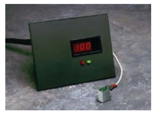
Display with single sensor.

Sensors can be installed viewing the lamp in many locations, provided that the temperature is below 100°C. Typically, a sensor just a few inches from the lamp will provide suitable conditions. Adjusting the sensor so that it "looks at" the reflected light and not directly at the bulb provides useful data, since the condition and efficiency of the