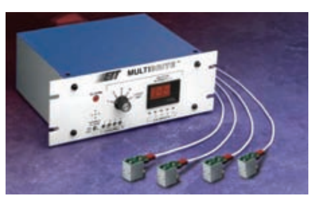
Display with four sensors.

The sensor provides an analog signal that varies proportionally with the incident UV energy. Sensors can be connected directly to a self-contained,